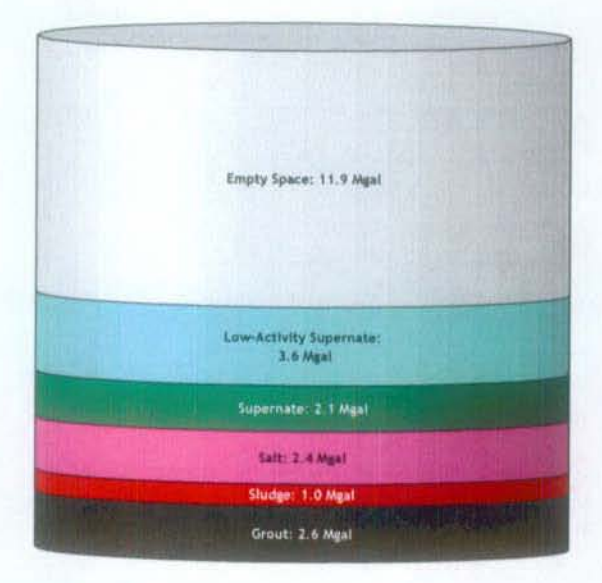
Figure 2: Current Old-Style Tank Contents

A summary of the remaining contents of the old-style tanks is shown in Figure 2.